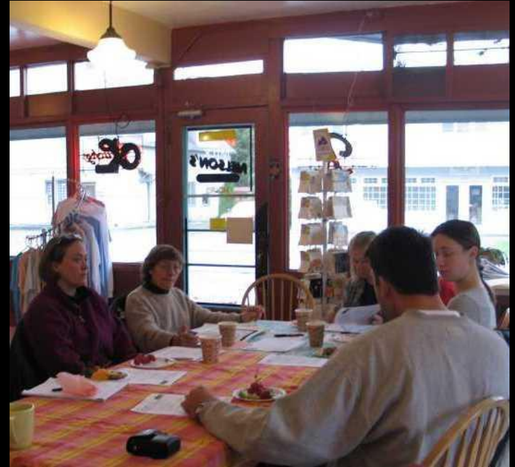
York Neighborhood Historic Preservation Committee meeting with the State Architectural Historian in 2006 to discuss National Register District nomination