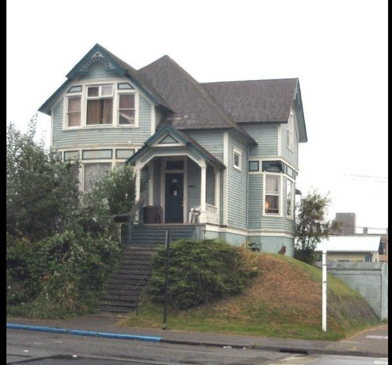
Sutcliff House in the York Neighborhood c. 1900s and in 2008