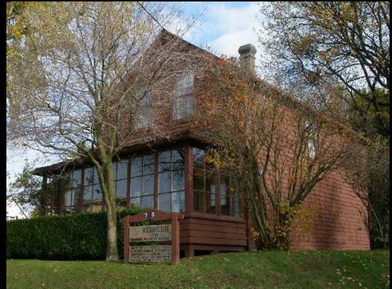
Pickett House National Register of Historic Places