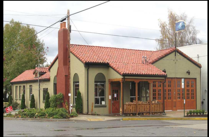
Fairhaven Fire Station No. 2 Bellingham Local Historic Register