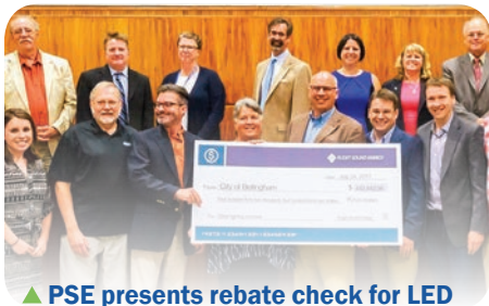
▲ PSE presents rebate check for LED conversion at City Council Meeting

In 2007, Bellingham was recognized by the U.S. Environmental Protection Agency as the state's first Green Power Community. That same year, the City set aggressive goals to reduce emissions and lessen our impact on the environment. In 2009, Bellingham City Council solidified that commitment, adopting "Legacies and Strategic Commitments" that included a focus on "Healthy Environment" and reducing contributions to climate change.