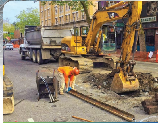
▲ Holly Street construction, downtown Bellingham