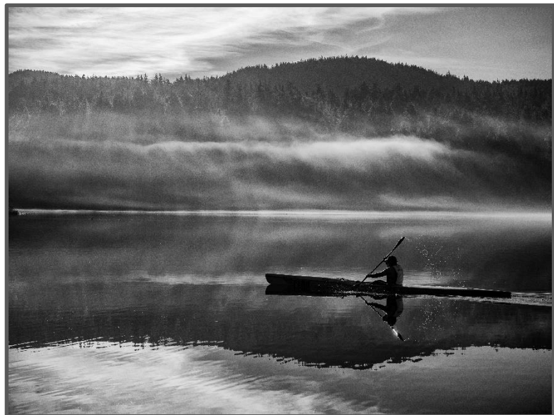
Lake Padden Park.