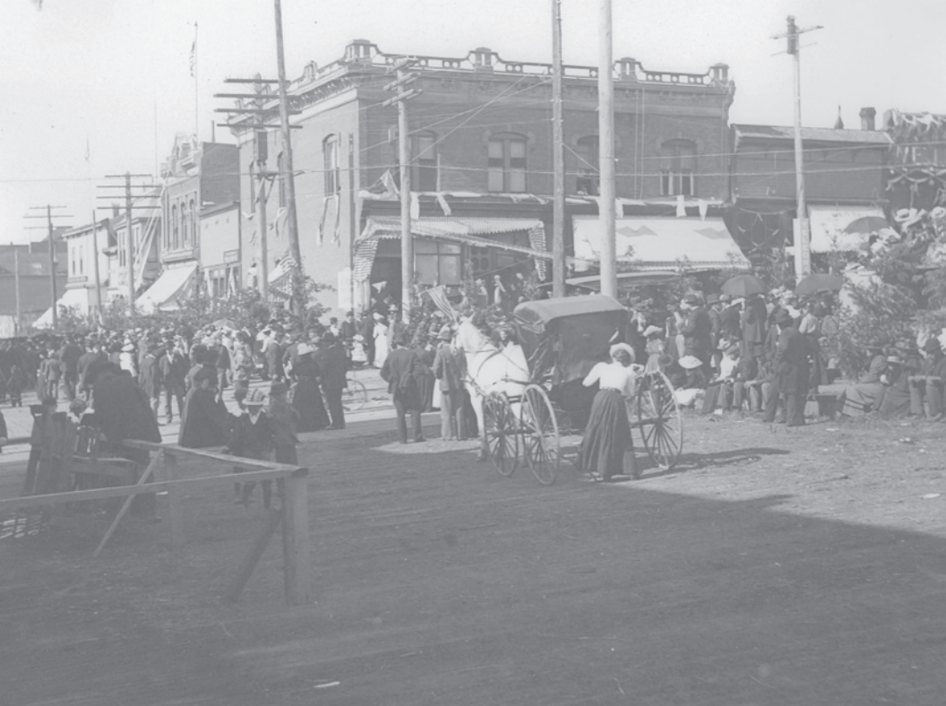
The Terminal Building prominent in the background, Fairhaven celebrated Independence Day with a street fair in 1900.