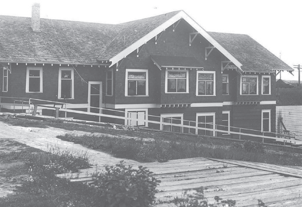
Columbia Avenue side of the Kulshan Club, 1909. Note the planked sidewalks.