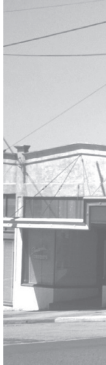
Photo of Fairhaven Pharmacy, 1953. Note the stripped-down hulk of the Fairhaven Hotel in the background.