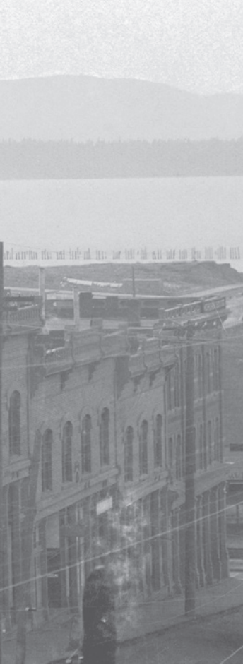
The Blonden Block, early 1900s.