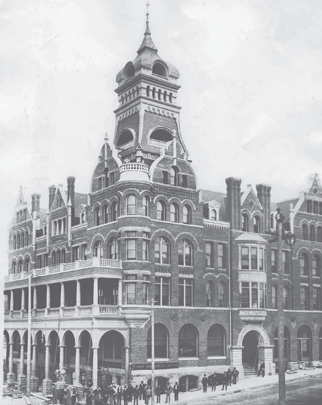
The Fairhaven Hotel in all its glory, September 1890.