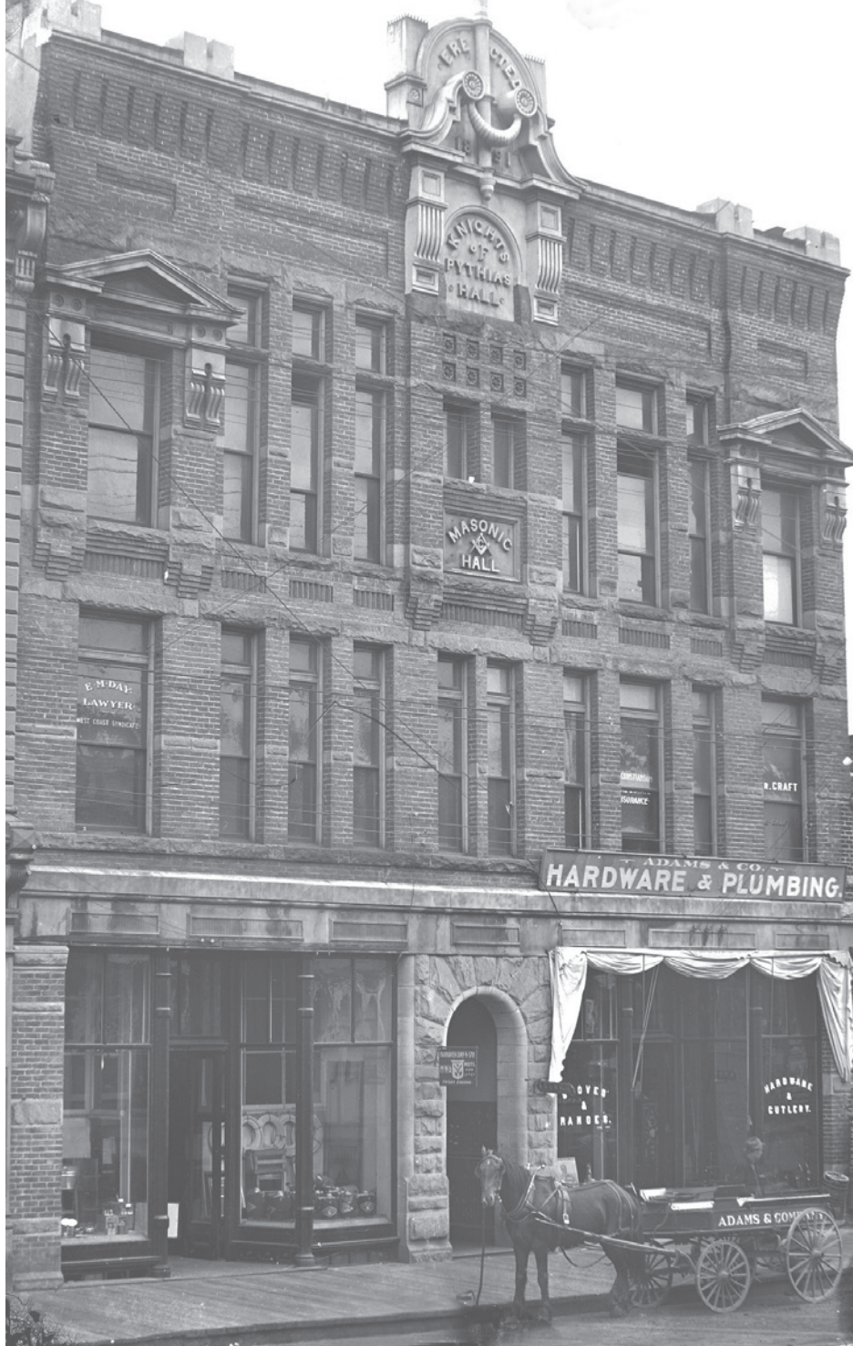
The Knights of Pythias Hall, the year Adams & Co. Hardware & Plumbing moved into the first floor and basement, 1907.