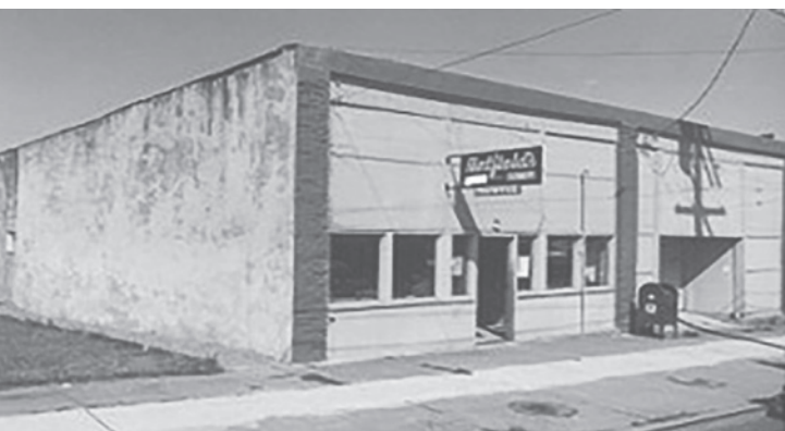
The building at 1308 11th Street wasn't much to look at by the 1960s.

In June 1980 the building was damaged by fire, but was completely rehabilitated by Ken Imus’ Jacaranda Development Company in 1985 using historic architectural elements salvaged from a building in Sacramento, California. The Glasserie, an art glass gallery, opened as the first tenant in the like-new vintage structure.