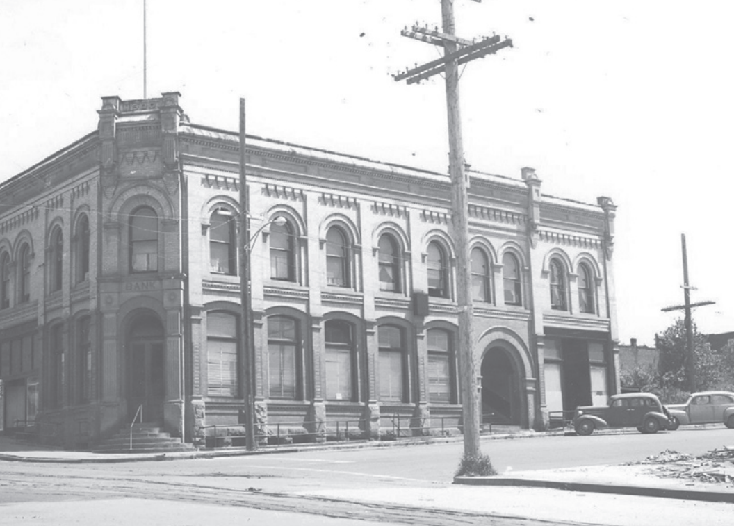
The Nelson Block in 1950.