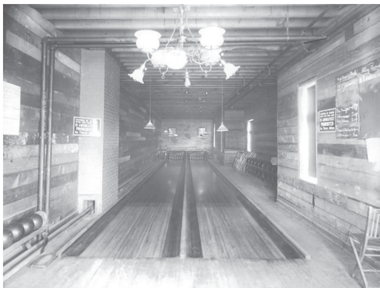
The Kulshan Club's bowling alley, 1909.