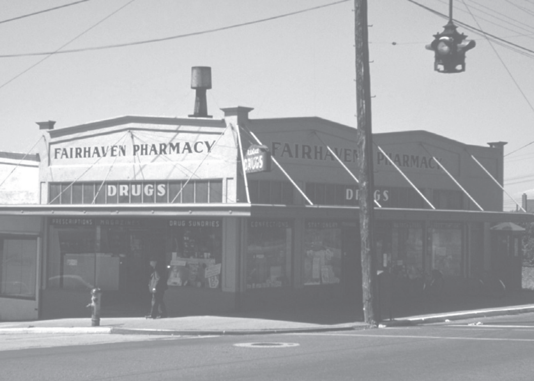
Fairhaven Pharmacy, ca. 1955.