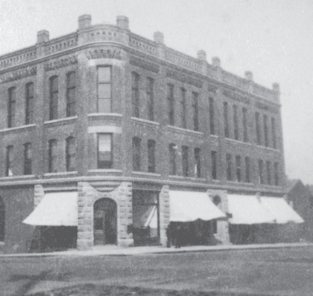
The Waldron Building in its original three-story format, ca. 1891.

The Kulshan Tavern, a favorite of local southsiders from the 1930s until 1975, occupied the corner space originally built for Waldron's Bank of Fairhaven.