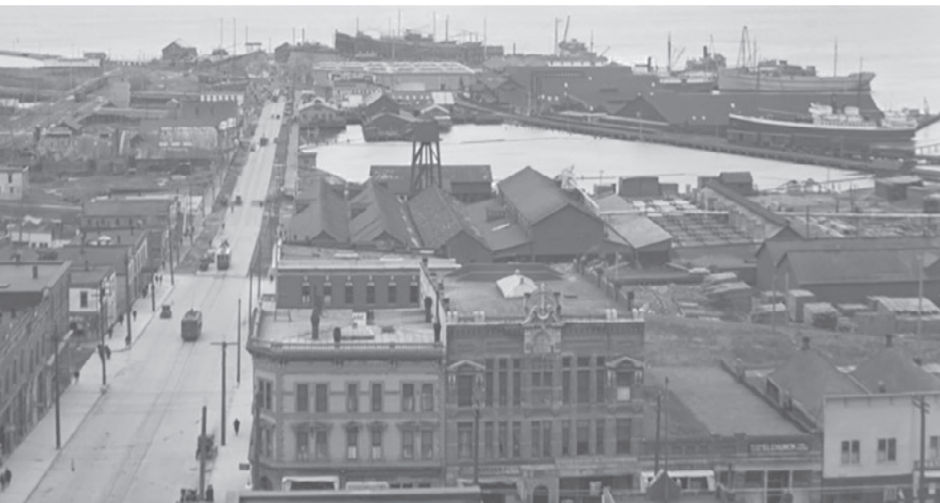
View west from the Fairhaven Hotel, 1918.