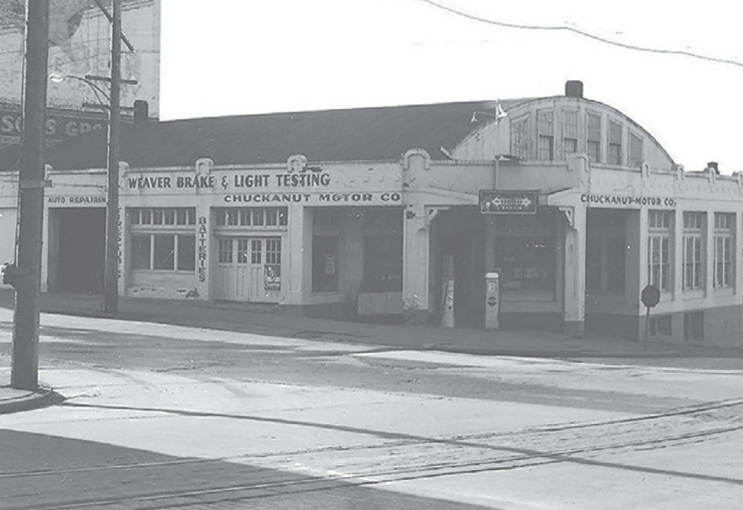
Chuckanut Motor Company, before the need for a traffic light at 12th and Harris, 1950.