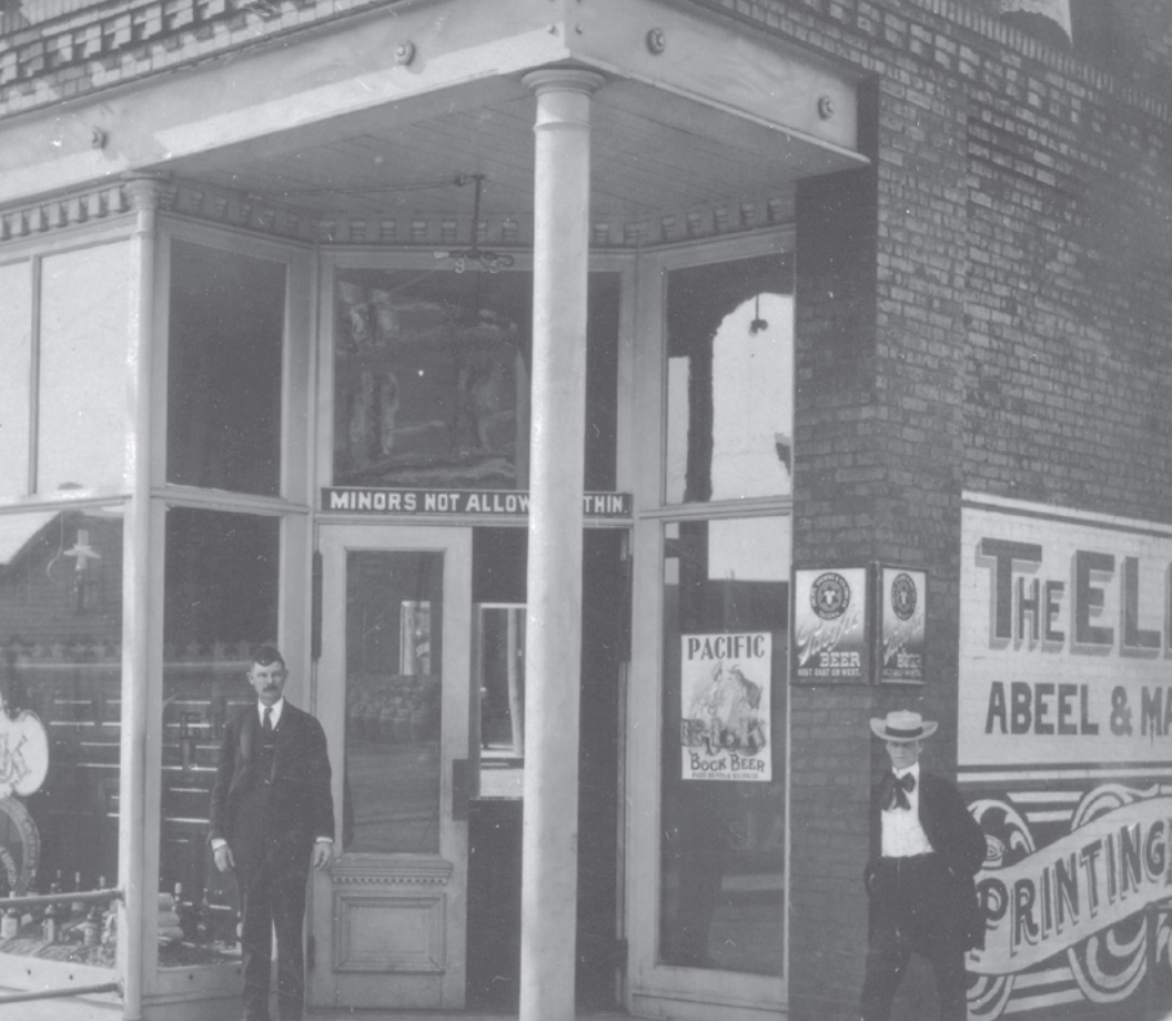
The Elk Saloon, 915 Harris Avenue, 1905.