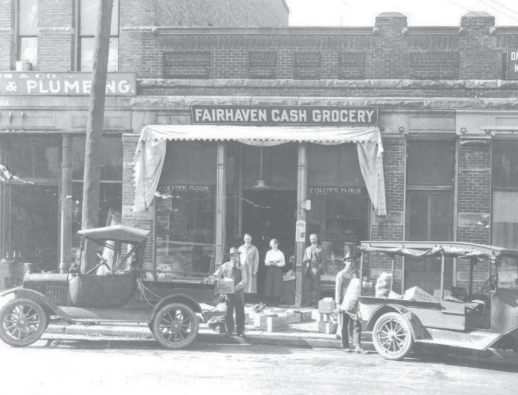
Fairhaven Cash Grocery, 1206 11th Street, ca. 1920.

Quick profits could be made during the Fairhaven building boom - in 1890 the Fairhaven Cash Grocery property was purchased for $2,500, and resold for $12,000 that same day.