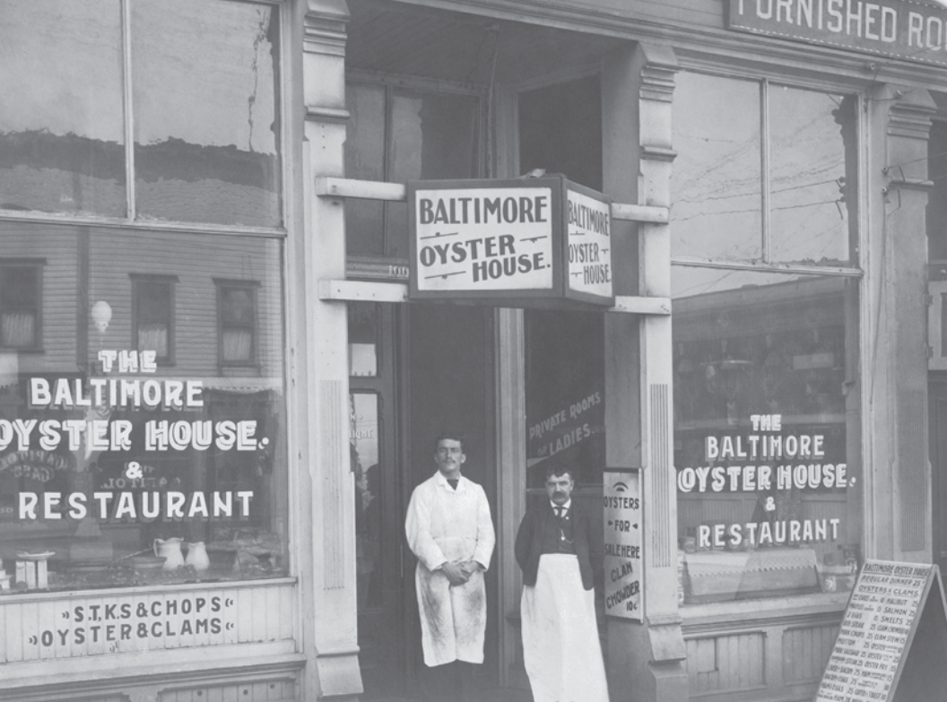
The Baltimore Oyster House and Restaurant, 1905.