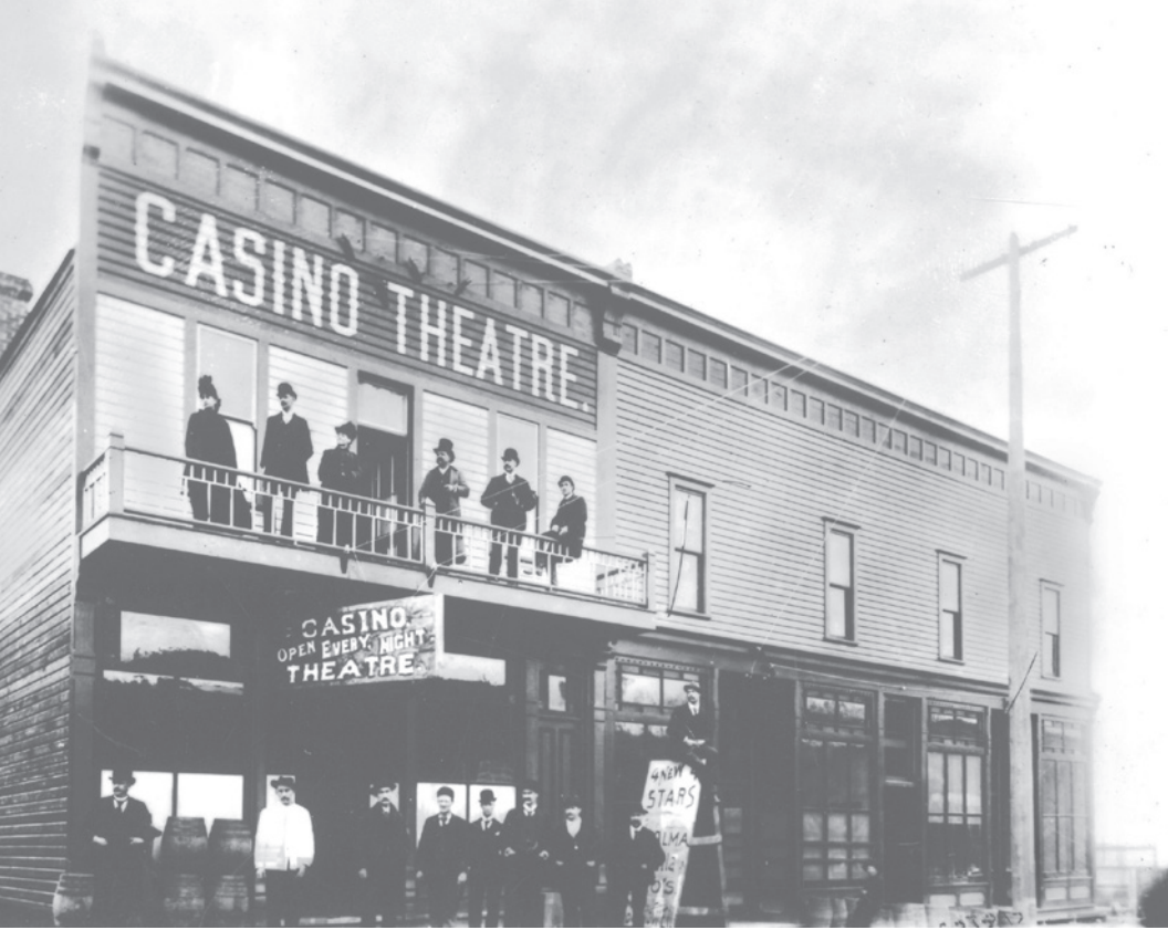
There was a party every night at the Casino Theatre, ca. 1890. Photographer unknown.