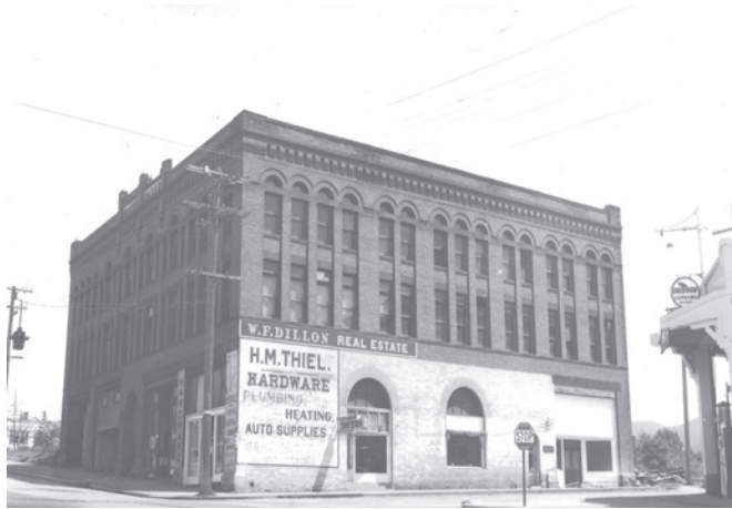
The Mason Block in 1950. Remodeling in the early 1970s saw the 12th Street façade receive large display windows and an antique clock added to the corner.