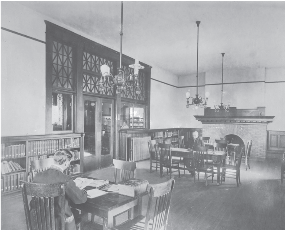
Main reading room, ca. 1904.