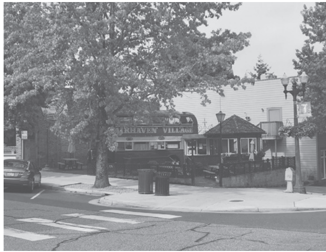
2019 photo of the corner where the Blonden Block stood..