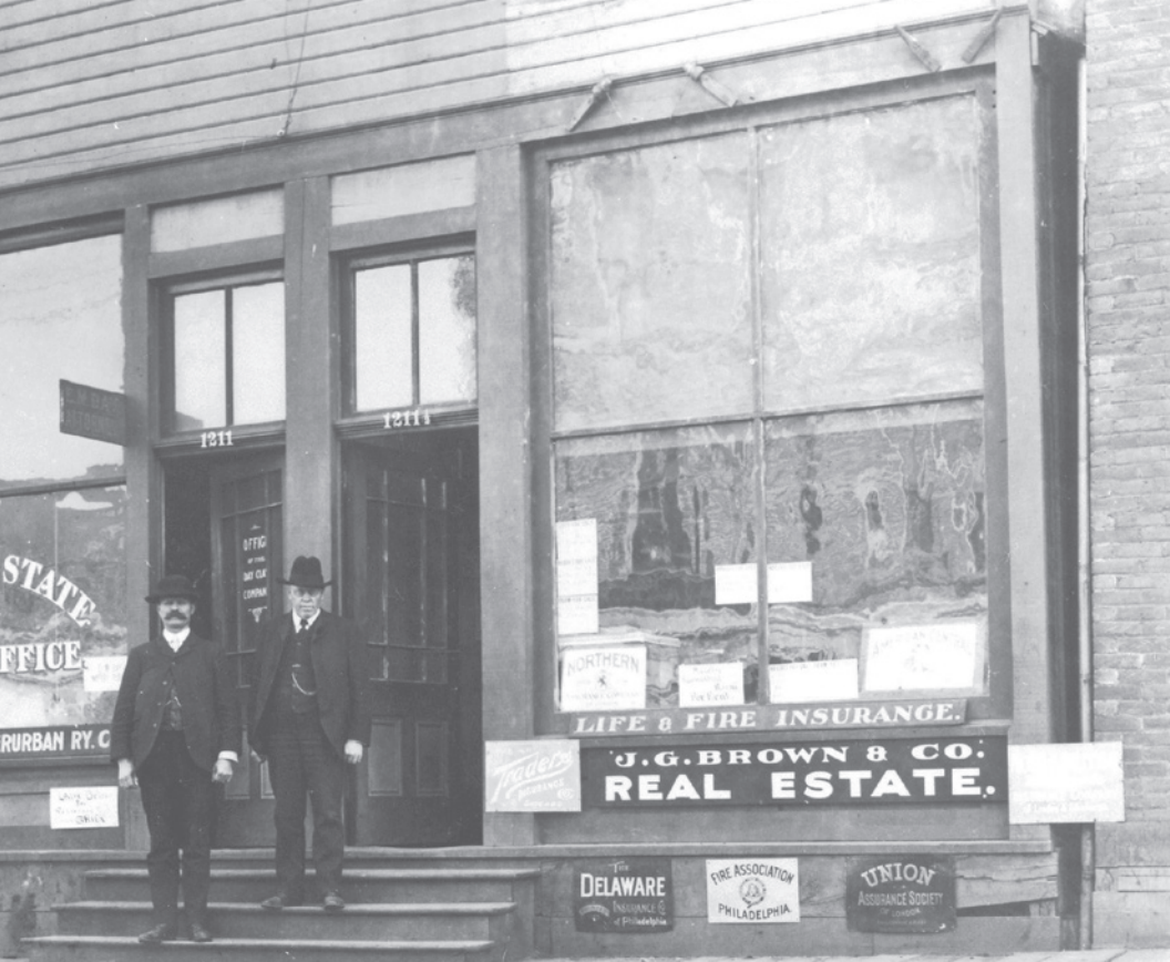
E.M. Day Building, 1211 11th Street, 1905.