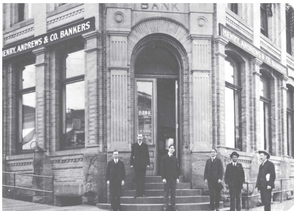
The bank staff, 1905.