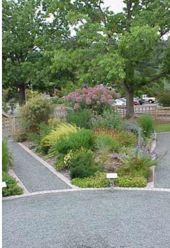
Orin and Althea Soest Herbaceous Demonstration Garden, UW Horticulture Center

For more information about Xeriscaping or planting native plants, visit or call your local nursery to see if they sell drought-tolerant or native plants.