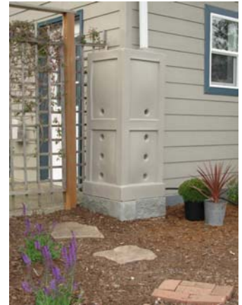
There are many different styles and sizes of rain barrels available to meet each person's preference and needs