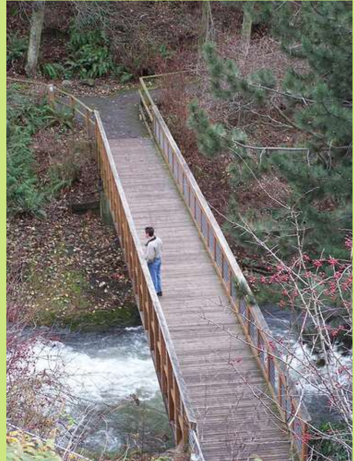
Whatcom Creek Trail and Maritime Heritage Park