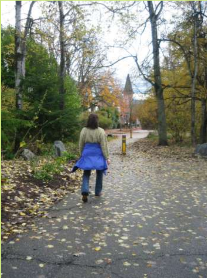
Old Village Trail