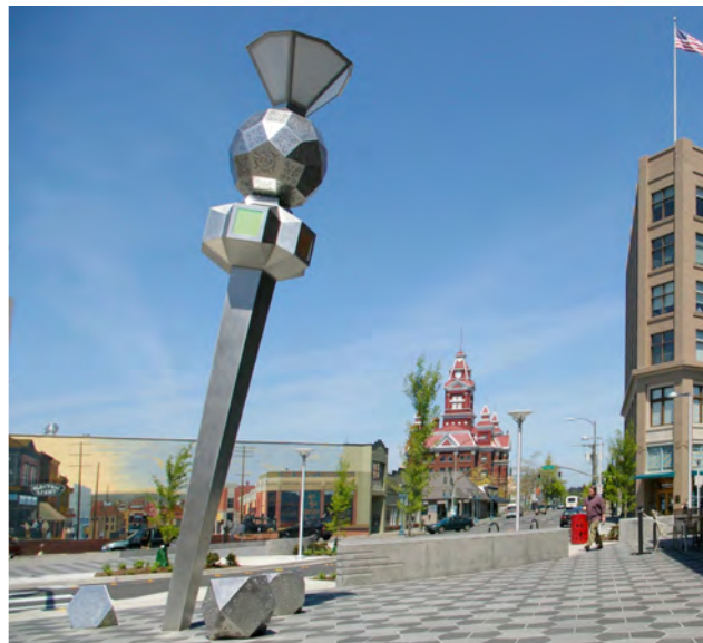
“Sentinel” by Ellen Sollod