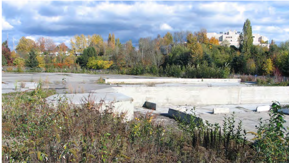
600 W. Holly Site