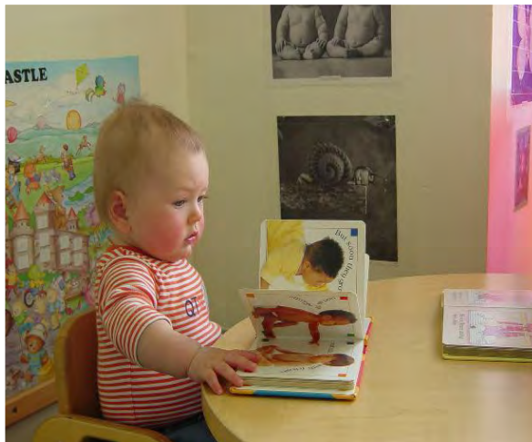
Bellingham Childcare and Learning Center Affordable Childcare for Low-Income Populations

Maintain existing resources in the community by making grants for the provision of housing and services to moderate- low-, and very low-income populations during calendar year 2010.