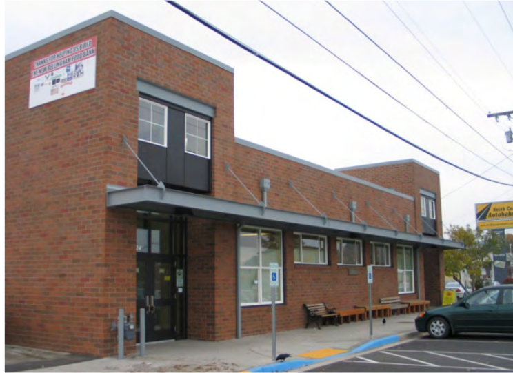
Bellingham Food Bank