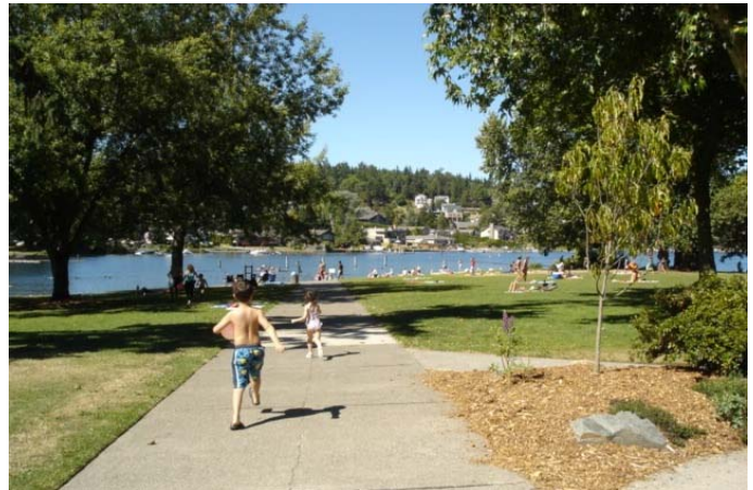
Bloedel Donovan Park