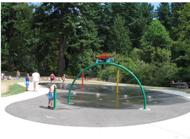
Cornwall Park Spray Park 2007

Some specific ideas suggested during the planning process to increase the variety of activities in the system include more spray parks, a wave pool, underwater park, rock climbing or bouldering, and a whitewater kayak course.