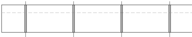
RISER ELEVATION SCALE 1" = 1'-0"