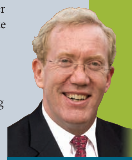
Dan Pike Mayor of Bellingham