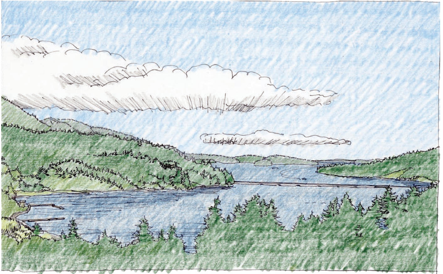
Looking south across Chuckanut Bay at railroad causeway penetrations, beach enhancements & future Woodstock farm park.

THE VISION FOR CHUCKANUT AND EDGEMOOR is one that emphasizes conservation and public access. The rugged shoreline and tidelands will remain accessible only by water or on foot. Eventually a safe water-grade trail is envisioned that will connect to both Fairhaven and the Coast Millennium Trail near Woodstock Farm. Woodstock Farm will become a new city park, and the railroad causeway across Chuckanut Bay will be perforated to improve water flow and allow for marine habitat enhancement. Kayak and other hand-carry landings will give boaters access to various points along the shoreline.