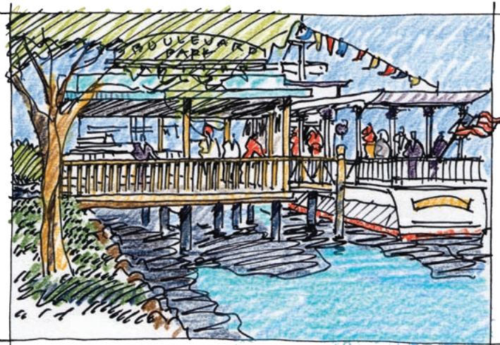
Water-taxi stop at Boulevard Park.

THE SOUTH HILL AND BOULEVARD waterfront will continue to be an area of open space, transportation connections, enhanced habitat and recreation. The vision for the area seeks to build upon and enhance these qualities. Connections between Fairhaven and the City Center will be reinforced with trail and transit improvements, including an over-water pathway between Boulevard Park and the Taylor Street Dock. Upland connections over the railroad and to the water will also be improved, and woodland vegetation on the hillside will be preserved. Beaches will be improved and hardened shorelines will be softened, while marine habitat will be enhanced wherever possible.